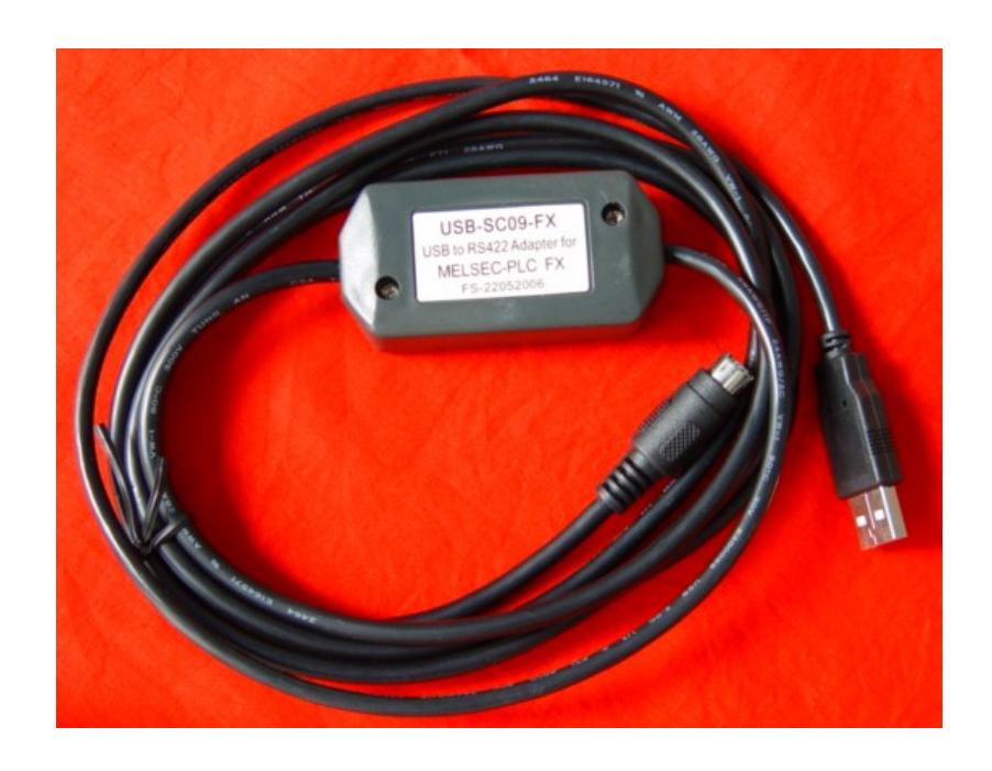
User's Guide for USB-SC09-FX Programming Cable